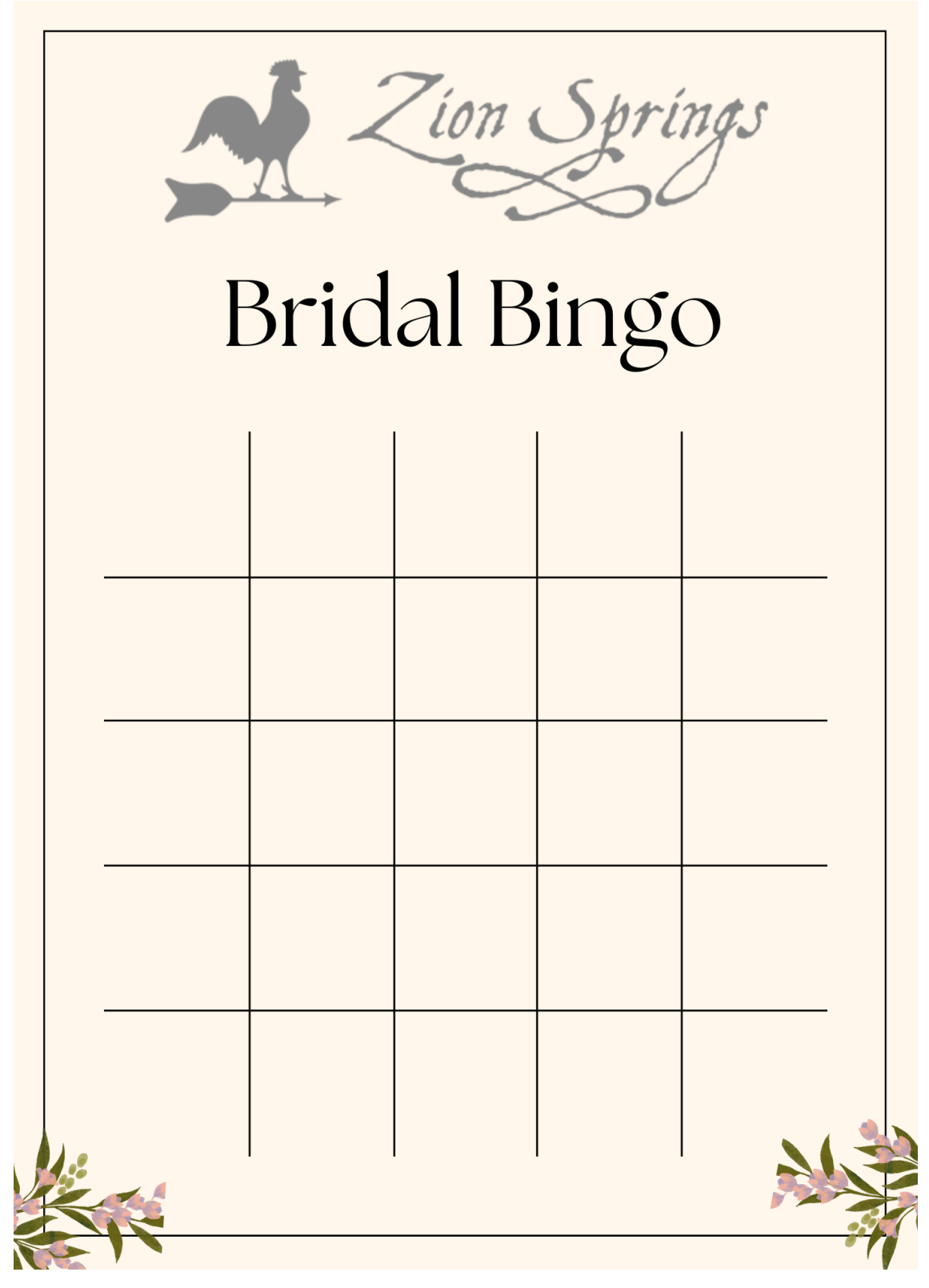
Download <u>Bridal Bingo Template</u> or <u>find a different one</u> that reflects your theme and style.

• The (Almost) Newlywed Game: A fun way to test how well the couple knows each other (and maybe learn some funny stories!). Prepare questions about their relationship history, preferences, and quirks. Have them write down their answers on separate sheets, then reveal them to the guests. Points are awarded for matching answers.